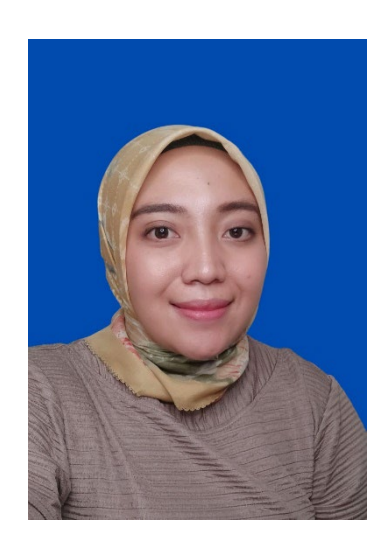
Regulatory Affairs, Government Affairs & Market Access Manager