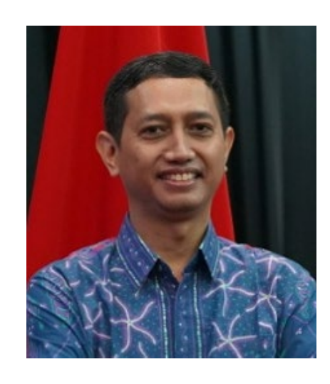
Expert Staff Indonesia Ministry of Health