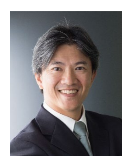
Healthcare Lead, Asia Pacific & Japan