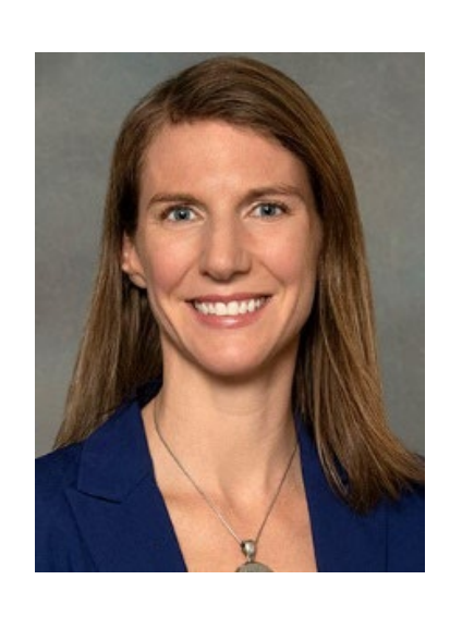
Regional Director for the Indo-Pacific