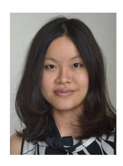
Head of Southeast Asia Government Affairs Varian Medical Systems