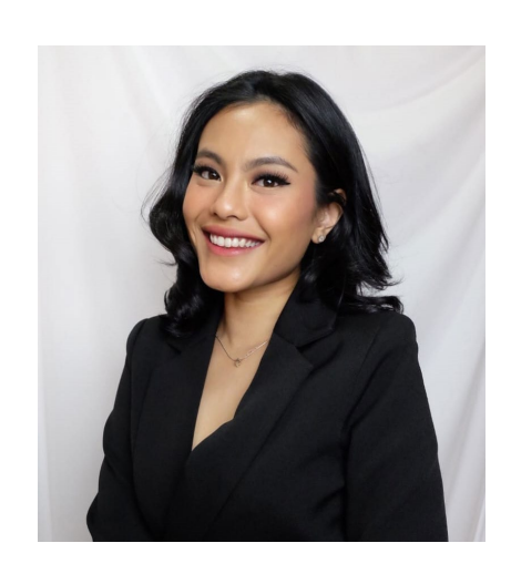
Partnership Manager, Digital Transformation Office