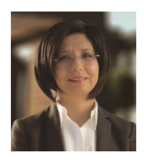
Lead Tier 2

Medical Device Regulatory Convergence, COVID-19 Project